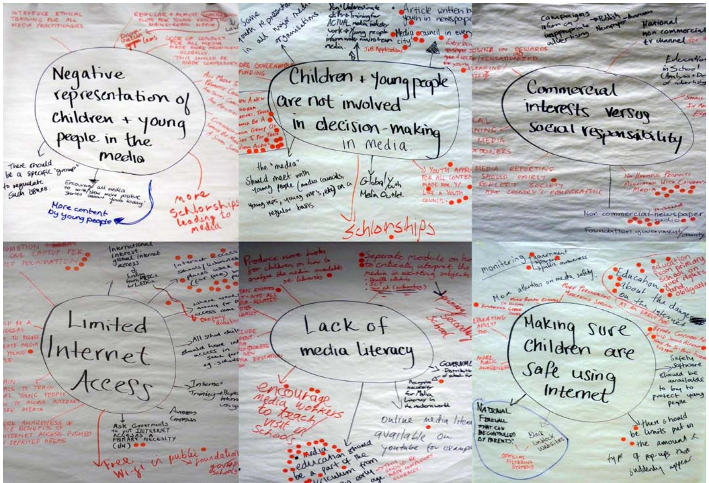
Figure 3: Six issues related to young people and global youth emerged through discussion and debate.

Limited access to the Internet - Governments, mobile operators and media multi-nationals should work together to insure free or affordable internet access in schools and libraries.