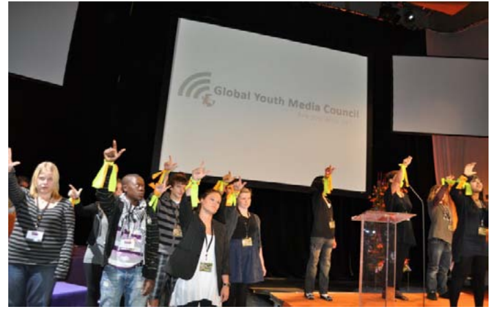
Figure 5: Members of the Global Youth Media Council producing an animation (left) and presenting as part of the closing ceremony at the 5th World Summit of Media for Children and Youth (right).

The culmination for the Global Youth Media Council was involvement in the Summit closing ceremony. This was one of the highlights of the Summit and brought the youth council together with the adult delegates at the Summit (Figure 5). The final presentation can be seen at: https://www.youtube.com/watch?v=tVSKI-CbCmw