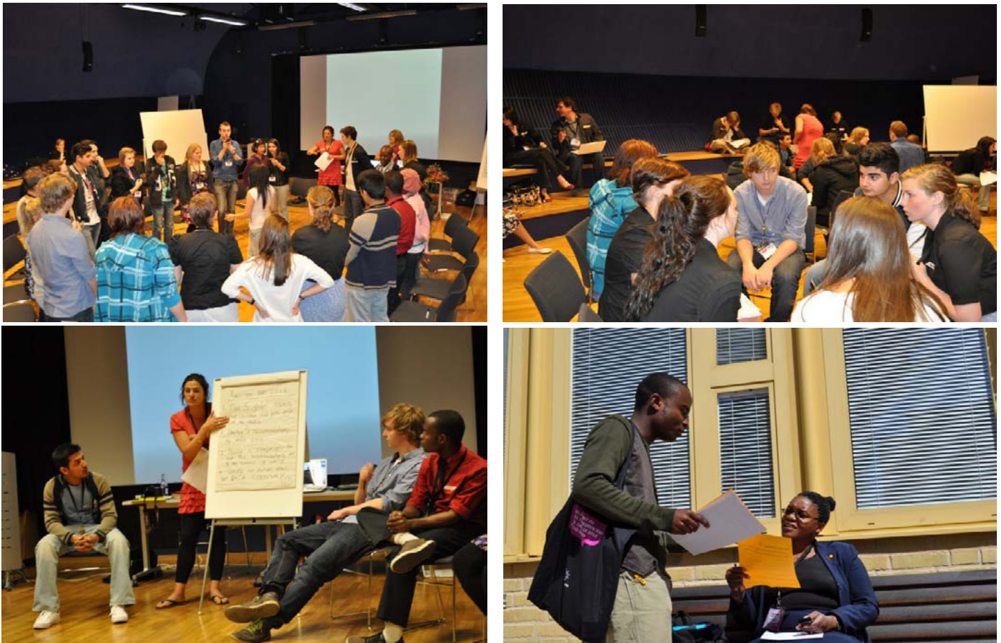
Figure 2: Members of the Global Youth Media Council discussing issues and recommendations for improvements in youth for media.

The final two days involved practical production activities in which the students worked in teams to: