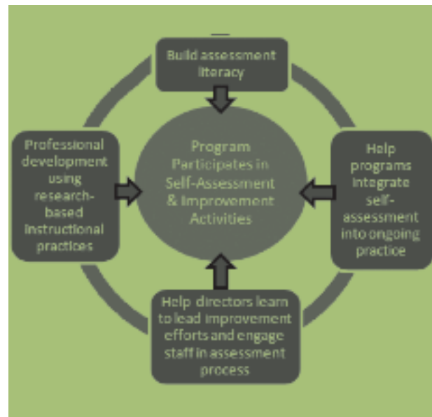
Figure 5. Accountability System Element: Opportunities for Skill Building

nizations to assess and strengthen their data collection and performance management systems through a rigorous two-year support process (Black Ministerial Alliance of Greater Boston, 2011). Such intensive and focused interventions are comparatively rare. When providing programs with assessment literacy internally is not feasible, funders could encourage cohorts of funded programs to pursue “insourcing,” in which programs share an external evaluator while practitioners focus on learning to understand and use actionable data (Miller, Kobayashi, & Noble, 2006).