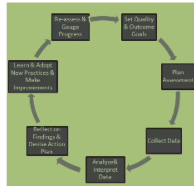
Figure 2. Cycle of Afterschool Organizational Learning and Improvement

For decades, the field of afterschool has sought to support children's positive development by creating quality standards for developmentally appropriate environments and by executing research-supported practices for advancing children's learning. These same principles can support the development of afterschool programs as learning organizations striving to improve quality.