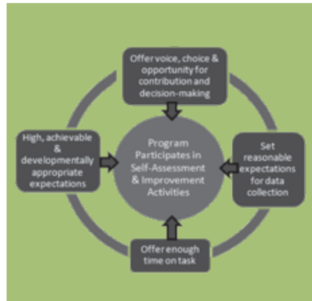
Figure 6. Accountability System Element: Appropriate Structure and Expectations

Offer enough time on task. Program improvement must be recognized as an integral piece of quality youth programming. Funders must, therefore, provide money to allow programs to dedicate paid staff time to assessment and improvement. Otherwise, these activities will continue to take a back seat to program operations and other daily responsibilities. Ideally large programs would dedicate one experienced staff person to lead assessment and improvement activities.