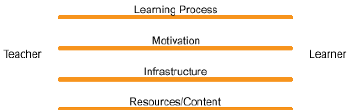
Figure 1: Web 2.0 mediated learning tensions between teacher and learner

Consequently, it makes good sense to connect web 2.0 with a problem-based approach to learning, but at the same time, new tensions and challenges arise. Particularly questions concerning power distribution between students and teachers become pertinent when combining student-centered pedagogies and web 2.0 learning practices. Glud et al. (2010) undertook some research within web 2.0 mediated learning taking point of departure in the aspect of power in PBL settings and mapped such tensions across four central dimensions, which practitioners can use to reflect on their design and values (see Figure 1):