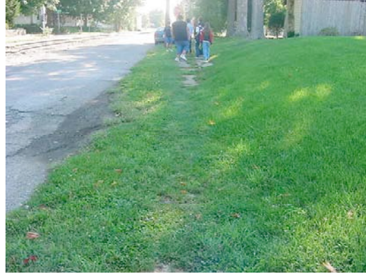
Grass has overtaken our sidewalks

Both teachers and students began questioning why the sidewalks were so inaccessible. Upon returning to school, students wanted to know who to call to fix the problems. Questions arose, like, “Who do we call to complain?”, “Who is responsible for fixing sidewalks in front of houses?”, “How much would it cost to fix them?”, and “What can we do to help?” They quickly learned that the teachers did not have the answers they wanted.