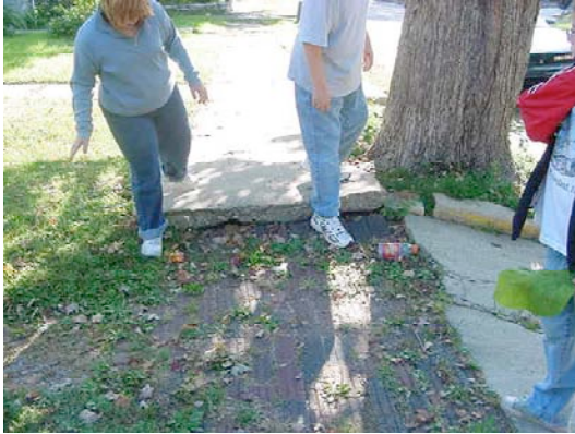
Uneven and missing sidewalk sections interfere with mobility

It was a beautiful spring day, and the Physical Education teacher was preparing to take the middle school Adaptive Physical Education class for a walk. The students enjoyed the first block of their walk, seeing the swaying trees and colorful flowers, feeling the warm sunshine and smelling the freshly cut grass. However, their enjoyment was short-lived. The students soon encountered several problems for their classmates who depended on wheelchairs for mobility. Sidewalks in all directions from the school were broken by large, knotted tree roots jutting through them; grass and weeds covered large sections of the sidewalk; and bushes and parked vehicles intruded over the pathways. This quickly ended the excitement for the students who had looked forward to being outside on the first nice spring day.