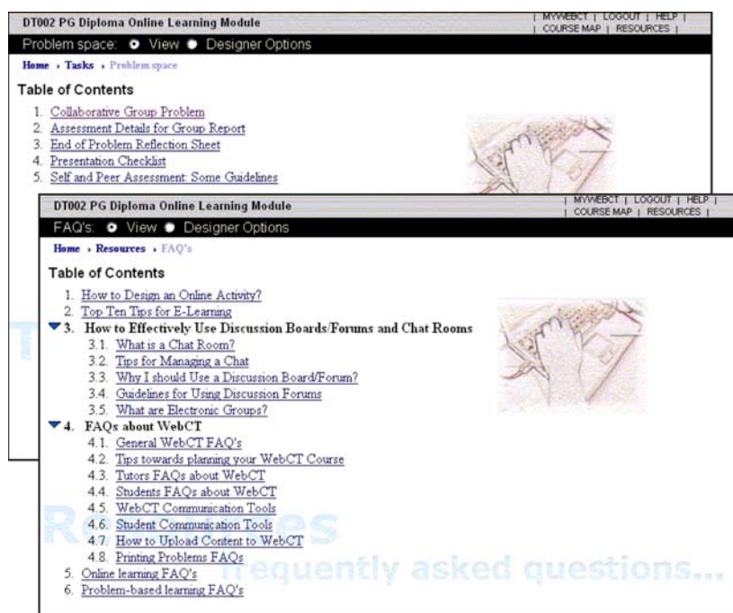
Figure 1. Shows two screen-shots of the blended PBL module in the virtual learning environment 'Webcourses', one showing the problem/task space and the second illustrating a selection of the virtual resources.

Figure 2 shows the blended PBL tutorial process as discussed in this study at the centre of the transformative learning cycle which participants experienced. The tutorial process consisted of the traditional PBL steps of problem-solving, self-directed learning, critical discourse and reflection and communal knowledge construction. A blend of face-to-face, computer-mediated conferencing (CMC) and video conference (VC) events, preceded by an online pre-induction session which all the participants experienced, prompted a series of stages leading towards transformative learning. These stages were activating events, articulating assumptions, critical self-reflection, engaging in discourse and testing and applying new perspectives.