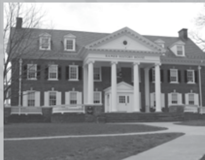
Lafayette College Interior Adaptive Reuse

New Construction • Renovation • Additions • Adaptive Reuse Preservation • Masonry Stabilization • Structural Intervention