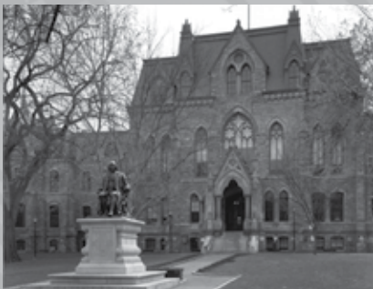
University of Pennsylvania Historic Stone Facade Repairs

Solving structural challenges for colleges & universities since 1953