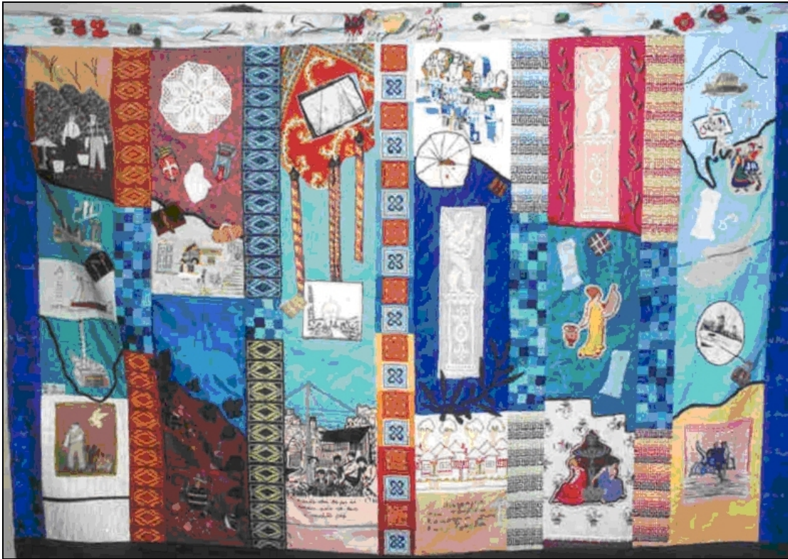
Figure 1. A photo of the completed tapestry, ‘The Journey’

and the memorabilia presented. The participants offered their thoughts on how the chosen images might be arranged and discussed the relative merits of suggested colours and tones. (See Original Design Plan, Figure 2).