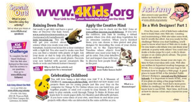
Figure 1.4 Kids.org as it appears in weekly print syndicated publications.

Since its inception in 1995, 4Kids.org has appeared in more than 500 weekly issues published in newspapers worldwide to promote use of the Internet and technology literacy. The database containing these website selections and reviews can be accessed online at http://4kids.org/ in the "Back Issues" section. Every week, 4Kids.org features three websites carefully chosen by staff members. Sites are reviewed and selected for inclusion in the publication if determined to be educational, kid-friendly, and free of advertisements. Many of the featured sites are interactive and encourage learning through games, quizzes and online research activities.