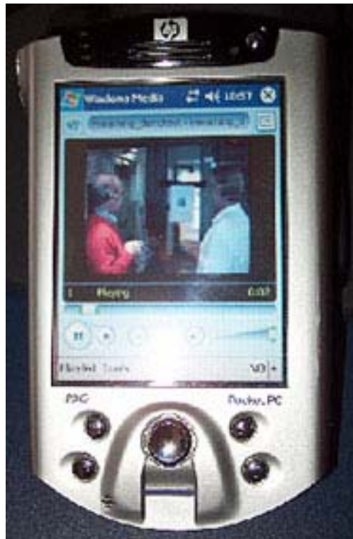
Figure 5. Video on the PDA