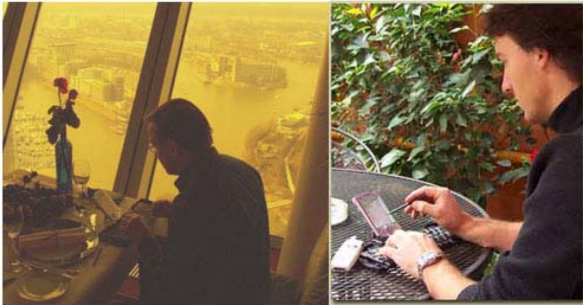
Figure 2. The picture on the left shows a tutor 'on the move,' writing and sending emails to his students from Düsseldorf 'Himmelturm.' The next picture is of a student on holiday communicating from the garden of his hotel in Rome.