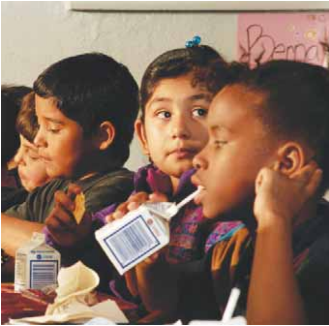
Eating a well-balanced, low-fat diet (above) and engaging in regular physical activity (right) will help children avoid type 2 diabetes.