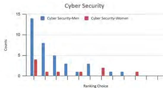
Figure 3: Cyber Security Ranking by Gender

Looking at the distribution of the rankings for the "Cyber Security" and "Cyber and Forensics" titles (Figure 3 & Figure 4) by Gender we find clear differences in the distribution, even in the overall mean rankings were similar.