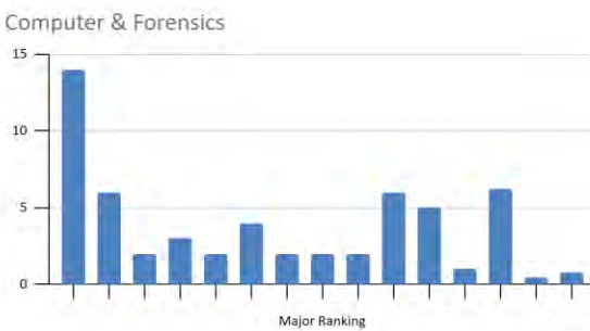
Figure 2: Cyber & Forensics Rankings

Not all subjects were currently enrolled in a Cybersecurity-related major; some subjects (N=6) who participated in the focus groups and ranking were in more generic Computer-related fields, such as CIS, Computer Science, or Software Engineering. A review of the data with only the Cybersecurity-related majors showed similar results. Table 7, Appendix A shows a reduced and consolidated set of data. The numbers were exactly the same as the overall numbers.