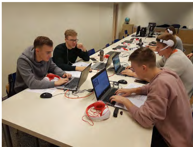
Figure 2. Typical Classroom Setup Used for Data Collection in the Present Study

the activities, the teacher was present in the classroom and carried out routine tasks involving monitoring groups' activities and offering help when needed. Students were in the same classrooms and instructed to use headphones primarily capturing high-quality audio through microphones. Teachers seated students based on the classroom's logistics. Participants from the same group sat close to each other. Figure 2 shows a group of students during the activity.