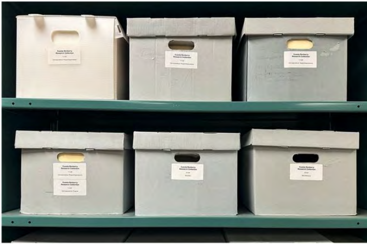
Boxes from the Michigan State University archive holding ephemera documented by the BDQHP hub in the Quilt Index.

A new resource, the Black Diaspora Quilt History Project (BDQHP) , aims to preserve a body of data of this important traditional expressive art in its myriad forms and to make that data freely accessible for teaching and research. The BDQHP is an intentional effort to digitally gather primary and secondary sources on African American, African, and African Diaspora quilt history drawn from geographically dispersed public and private collections. This data is then being added to a BDQHP hub in the Quilt Index , an international humanities project based at Matrix: Center for Digital Humanities and Social Sciences at Michigan State University.