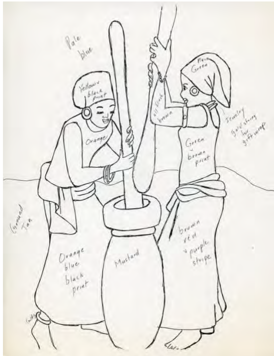
Women working together pattern from Cuesta Benberry's Archive.

important to know and/or share these stories? Learners are similarly guided through considering implications of these artifacts within learners' current lived realities, as well as ways these artifacts might inform how they think about and engage with one another and the natural world, both now and in the future.