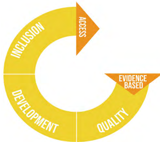
Fig. 2: Essential Elements