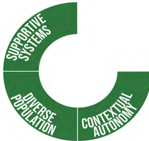
Fig. 3: Essential Conditions

The Essential Conditions (Figure 3) are the environmental and population-focused aspects that surround the Essential Elements and ensure success and access. These are what need to be understood so as to develop programs based on who is in the school, what is happening at school, and what tools and supports are needed to make change.