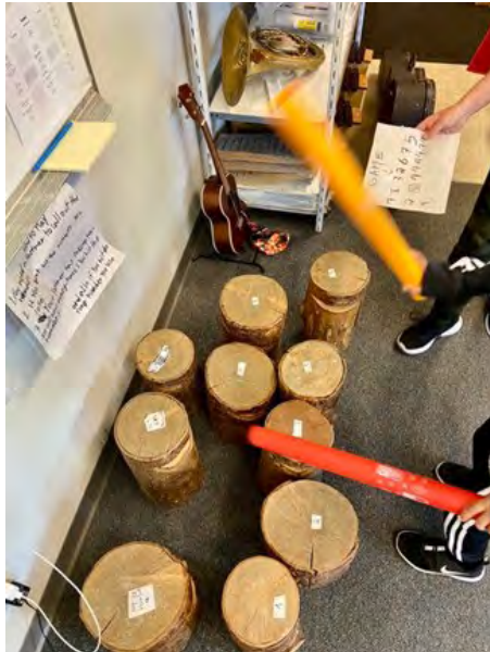
Fig. 3 Music version of Simon Says game. A Boomwhacker game.

The students explore the various projects for the rest of their music class. When class is over, the Grade 4/5 students eagerly head in to see their feedback and read about their experiences, illustrating the ongoing action research inquiry led by the students.