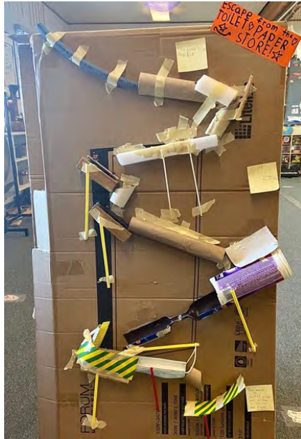
Fig. 1 Musical marble run.