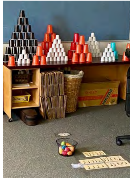
Fig. 4: Rhythm tossing game using egg shakers and jingle bells.