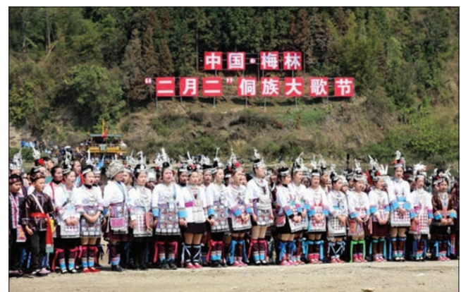
Figure 2. The sanjiang meilin dong grand songs festival in guangxi

The Dong Grand Song, a traditional Chinese singing instrument, faces numerous literacy, inheritance, and protection challenges. Economic development has led to migration