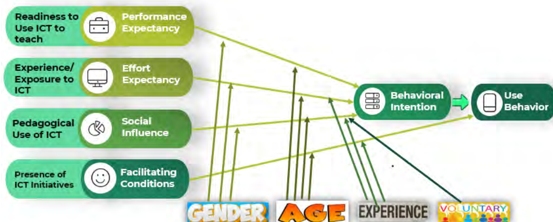
Figure 1 The UTAUT Theoretical Model (Venkatesh et al., 2003)

Moreover, Figure 2 illustrates the conceptual framework of the study that explains the interplay or relationship of the variables and/or parameters or constructs/indicators considered in the study. The researchers utilized the input-process-output-outcome framework that guides the researchers and the readers as to how the study was conducted. The input includes the identification of the profile of the participants and the UTAUT constructs as re-aligned to include, readiness to use ICT to teach, experience/exposure to ICT, pedagogical use of ICT, and presence of ICT initiatives. The conduct of the study was done using the validated and reliability tested survey instrument and random interviews were used during the validation of responses. The processing and evaluation of data results to the extent of readiness, exposure, and experience to ICT in teaching-learning and shows whether a significant difference exists in the constructs as influenced by the participants' profiles. ICT integration in the teaching-learning capability program and the plan is expected to be implemented towards an improved ICT integration in the classroom or in education and the provisions of ICT-enabled learning environment.