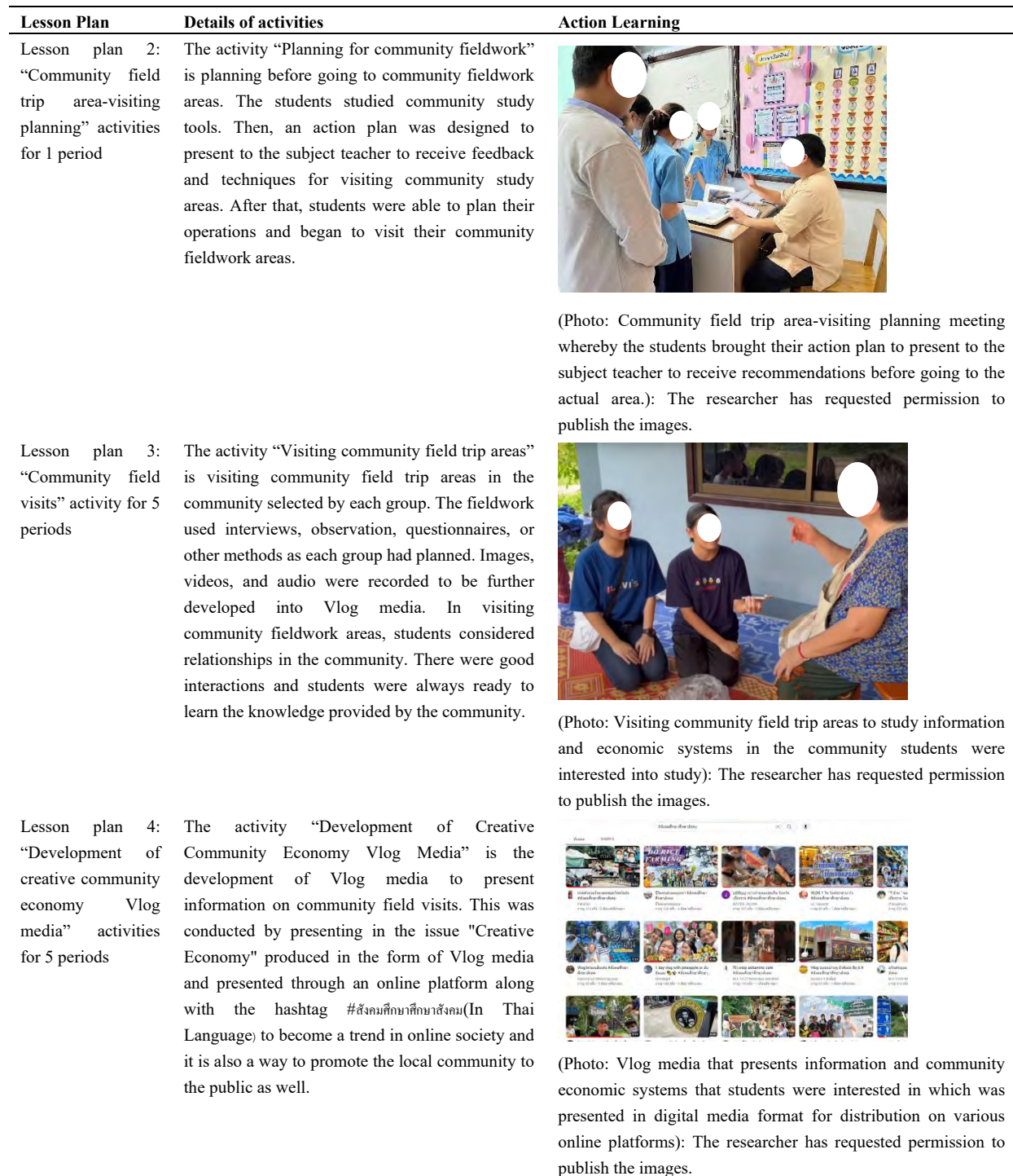
(Photo: Community field trip area-visiting planning meeting whereby the students brought their action plan to present to the subject teacher to receive recommendations before going to the actual area.): The researcher has requested permission to publish the images.