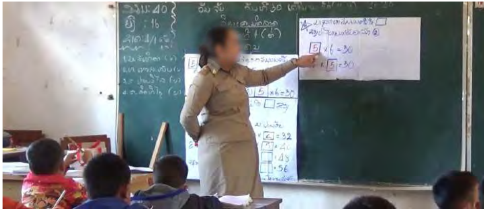
Figure 2. Ordinary language in the Lao PDR classroom

Teacher: This symbolic sentence alternates or swaps places.