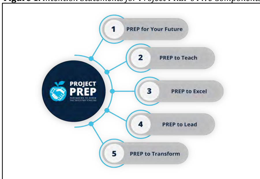
Figure 1. Intention Statements for Project PREP's Five Components

Specifically, Project PREP seeks to achieve four goals: 1) prepare diverse teachers to graduate and obtain high-need certifications, 2) retain teachers in high-need schools, 3) prepare school leaders to develop teachers and build a positive school environment, and 4) develop a systemic approach to foster equitable teaching outcomes. To achieve these goals, we have named the following values that guide our models for teacher education and learning: inquiry, partnership, leadership, systems of support, a practice orientation, and innovation. As Project PREP works towards its overarching vision, these values inform the development of five components through their enactment of the intention statements named in Figure 1 .