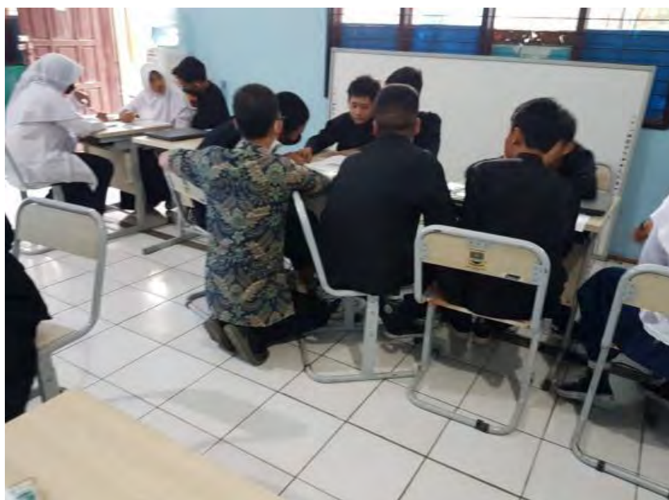
Figure 3. The teacher is providing guidance.

Based on observation, the guiding principle has been implemented by the teacher. In the guidance process, the teacher is seen actively approaching each group to ensure that they are working on exercises and providing guidance to groups experiencing difficulties. The teacher can be seen guiding one of the groups by sitting down with them to be on the same level as the students so that they feel comfortable and happy working on the problems (see Figure 3). It aligns with the research that stated RME can build students' happiness because RME motivates students to be active, creative, and encourage them to work together and communicate (Lesnussa, 2019).