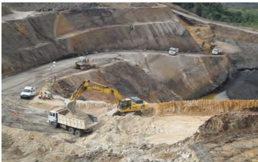
Figure 1. Roads condition in mining

Some of the observed teachers have already incorporated the principle of levels into their lesson plans by including problem-solving from the contextual/realistic level to the semi-formal level and then to the formal level. For example, in determining the gradient of a movement, students are asked to observe a picture of a winding road in a coal mining area. Then, the teacher asks if it is possible for a car at the bottom to climb up to the surface with a straight vertical path (informal level) shown in Figures 1 and 2.