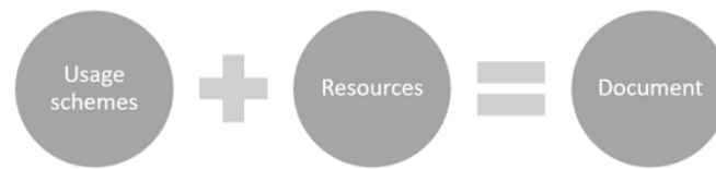
Figure 1. Formulation of a document (Gueudet & Trouche, 2009)

usage schemes of the resources (Gueudet & Trouche, 2012). This process that teachers go through to create new resources is called the documentation process. A document is much more than a list of resources and can be formulated as in Figure 1 .