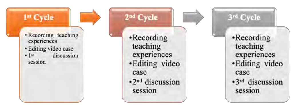
Figure 1. The research procedures of each group

This process was repeated three times for each teacher candidate. Therefore, each cycle for each group included four video cases, and 12 video cases in total were produced and discussed in each group. Figure 1 summarizes the case procedure.