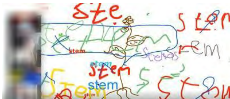
Figure 2. Teacher's and Students' Interaction Using Zoom's Interactive Whiteboard

In addition to instruction, UCIP created the instructional materials on the interactive whiteboard. For example, when discussing parts of a plant, students were challenged to name one part of a plant on the whiteboard. They activated Zoom's annotate feature to write a word corresponding to the image.