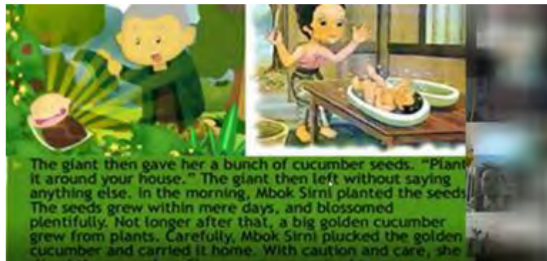
Figure 3. The Students' Connected Knowledge about Growing Cucumber from the Folklore with Science

Figure 3 explains how UCIP displayed a text in English and illustrations to describe the story's plots. The students were involved in the activity by reading parts of the story, asking questions and answering the teacher's questions. From the observation, one student initiated to get the cucumber from the kitchen to show the class. This situation provoked extended discussion and affected prolonged learning session, as in excerpt 3.