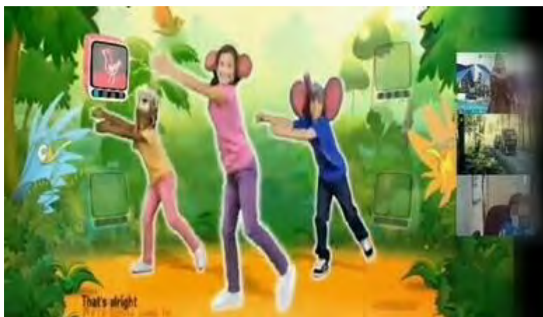
Figure 4. Observing Animal Behavior while Listening to, Singing, and Moving along the Animal Song

Figure 4 depicts how UCIP followed the animal movements, where students were instructed to move their bodies along the video. They were frequently reminded to move such as monkeys, elephants, tigers, and some other animals. As a follow-up, she explained different animals and their movements by translanguaging/trans-semiotizing, alternating the language use, and linking the explanation with the movements. It was reported that movements are advantageous during forced-remote learning since students rarely move physically because of some distancing restrictions during the COVID-19 pandemic.