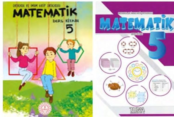
Figure 1: The Cover Images of the Selected Textbooks

April 18, 2019, for the use for next five years from 2019-2020 academic year. The images of those textbooks were given below in Figure 1.