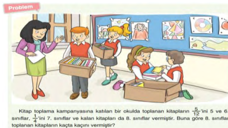
Figure 7: Representation about the value of helpfulness and responsibility

In the activity “Let’s Do It Together: 7” (NEP, p. 37), the damage of erosion and the importance of planting trees to prevent erosion are mentioned. In this example, which is also supported by a visual, protecting the natural heritage and fulfilling responsibilities towards the environment were emphasized, therefore, the values of patriotism and responsibility were identified. The next example reflects the values of helpfulness and responsibility .