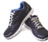
Figure 4: Representation about patience and self-control values

The question states, “Sedat, who saved 20 TL from his pocket money every week, bought a sneaker at the end of the sixth week with all the money he saved. How much is the price of the shoes?”