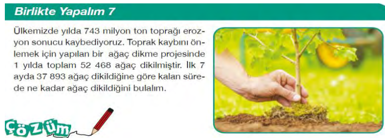
Figure 6: Representation about patriotism and responsibility values

In the 9th question (NEP, p. 188) in the “Unit Evaluation” section, brushing teeth, as a health care activity, and saving water themes are attached to the problem. Taking care of one’s health is an indication of his responsibility towards himself. In addition, performing mathematical operations linked to prevent water waste also instills a sense of responsibility towards the environment . The rapid decrease in water resources, which is one of the global problems, and the fact that scientists have scenarios such as “water wars” in the future also increase the importance of this example. The next one is about patriotism and responsibility values.