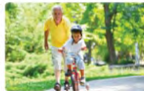
Figure 5: Representation about the value of love and helpfulness

Sizce %6 gösterimindeki “%” sembolü neyi ifade eder? Günlük hayatta “%” sembolünün kullanıldığı gösterimlere örnekler veriniz.