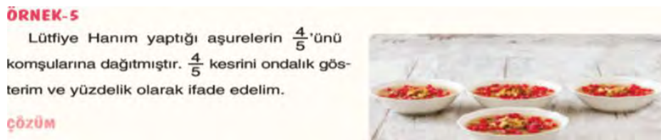
Figure 2: A representation about friendship value

The sixth question in the “Your Turn” section of the textbook includes a person named Murat who helps his friend by lending a portion of his salary. Murat’s behavior indeed reflects trust and loyalty, as the behaviors characterizing the value of friendship .