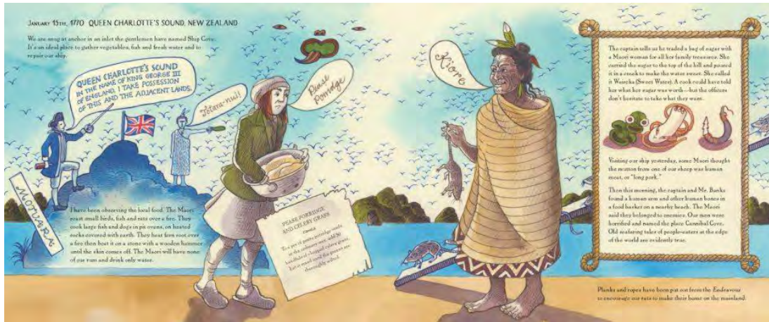
Figure 4. Māori and Pākehā: Fusion and confusion. (Bishop, 2018a, pp. 19–20)

reproduces history by having Cook stand on the island's summit to take possession of it and adjacent lands in the name of King George III, while his failure to communicate adequately with Māori is suggested in the placement opposite but apart from him of a Māori chief (see Figure 4).