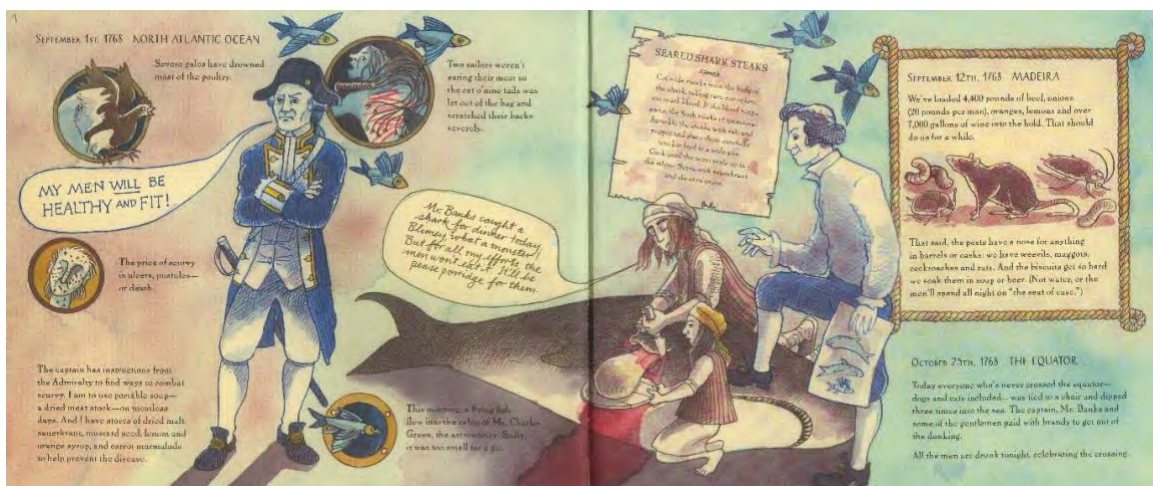
Figure 2. Static and mobile images. (Bishop, 2018a, pp. 7–8)

Thompson’s log entries for September 1st, 12th and October 25th, 1768, and the accompanying double-page illustration of the Endeavour’s period in the North Atlantic Ocean and crossing of the equator emphasise restriction and movement. For example, a close-up static image of the solitary Cook shows him standing erect, arms folded, gaze unflinching as he seeks to stamp out scurvy while avowing, “MY MEN WILL BE HEALTHY AND FIT!” (Bishop, 2018a, p. 7), implying he is locked within a class of his own. Porthole frames, like those on the first endpapers, similarly portray imprisonment and stasis, with crew members trapped within the Endeavour . And then there is the shark that has been hauled from its natural habitat, ironically by Banks the naturalist, to lay prostrate in death on the ship’s deck where it is dissected to provide the crew’s dinner (see Figure 2).