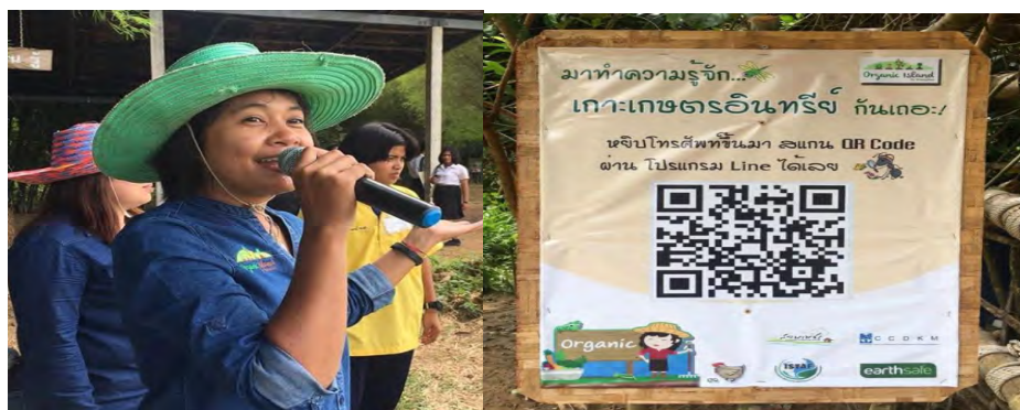
Figures 3 - 4: The Smart Organic Island Farm, Phetchaburi, Central Thailand