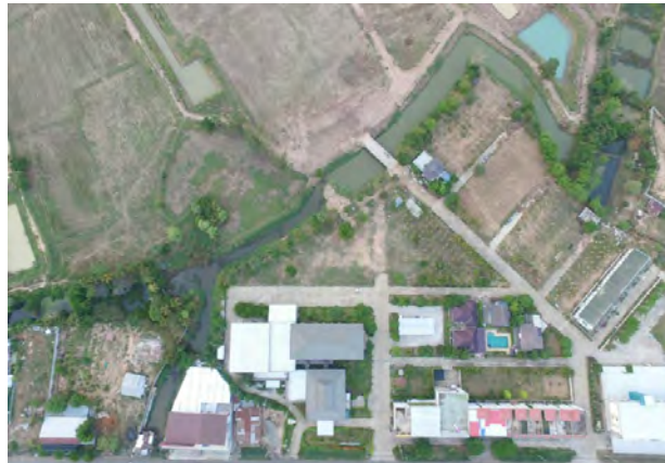
Figure 6: SAB — Safety Agri Burirum Farm