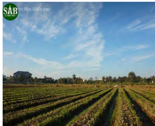
Figure 7: The Social Enterprise Smart Farm Hub—Northeast Thailand

A medical doctor who has deserted land at the back of her small hospital has also tried the SDG smart farm model since 2016 and commented as follows: