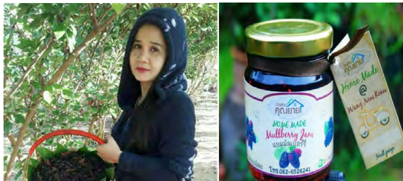
Figure 5: The “Liberal Farm”: The Smart SME Farm Family, East Thailand