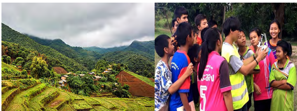
Figure 2: The Smart Farm of Karen Tribe, North Thailand