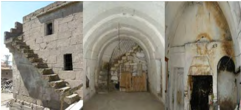
Examples of Houses in Guzelyurt