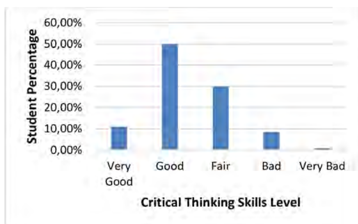
Figure 4. Histogram of Students' Critical Thinking Skills Level Achievement

Based on Figure 4, the highest percentage of students among other criteria is a good criterion. It shows that students' critical thinking skills in all indicators have developed well; in other words, the balance in all hands is included in good criteria. The discussion of each indicator is as follows.