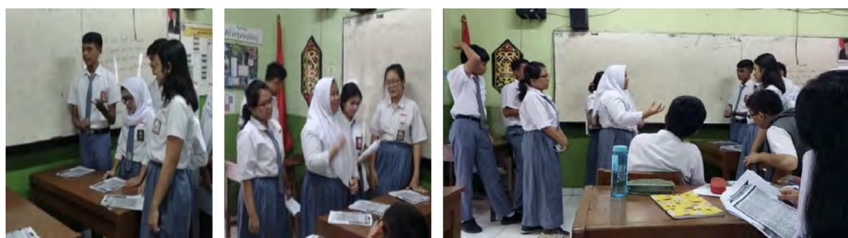
Figure 3. The Debate on the Second Article “Are There Benefits of Rainwater?”

This stage involves the debate of social issues from different perspectives, and enables students to engage in a discussion according to the available evidence. Discussion and evaluation from different points of view is a way to unite the decisions of each individual by explaining, evaluating, and comparing different perspectives on the problem (Stolz, Witteck, Marks & Eilk, 2014). In this study, students are divided into two groups of different points of view to debate about the theme that has been specified (see Figure 3).