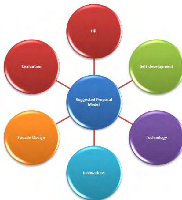
Figure 1. The axes of the suggested proposal