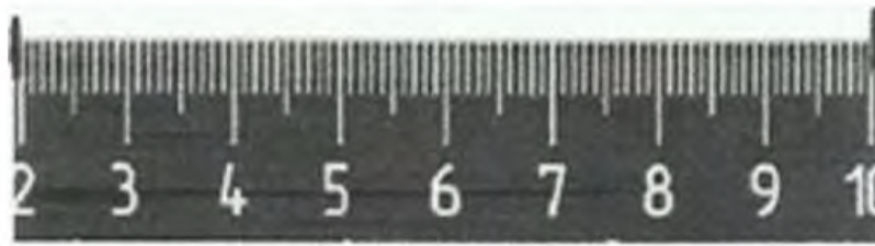
Figure 2. Broken ruler

physically showing how many centimeters there are in a meter is an effective way to help students understand conversion rules conceptually. Furthermore, one of US pre-service teachers explained that using different rulers, such as 30cm in length or 20cm in length, can be helpful to show length of an object would be the same regardless of the ruler's length. Similar to this suggestion, Turkish pre-service teachers explained that having students design their own rulers may enable them to notice their errors. Other strategies suggested by Turkish pre-service teachers to overcome these errors were re-teaching the topic, solving enough conversion examples, and making students familiar with these kinds of rulers. In addition to practicing enough examples before letting students solve conversion examples on their own, two US pre-service teachers stated that distributing a conversion rule sheet may be useful when students could not remember the rules.