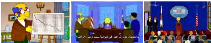
Figure No. (6) explains several cadres from one of the Simpsons episodes

In the rest of the episode, "Bart" is a failed music, while his sister Lisa was the first president of the United States - nodes here to Hillary Clinton - after the President Trump, who left the country in a bad financial position.as liza's dialogue : "We inherited a critical situation." When Lisa asked, her secretary – the president's Secretary of the United States - " Fan Hoten" for the financial situation, and he answered her : "we are bankrupt".