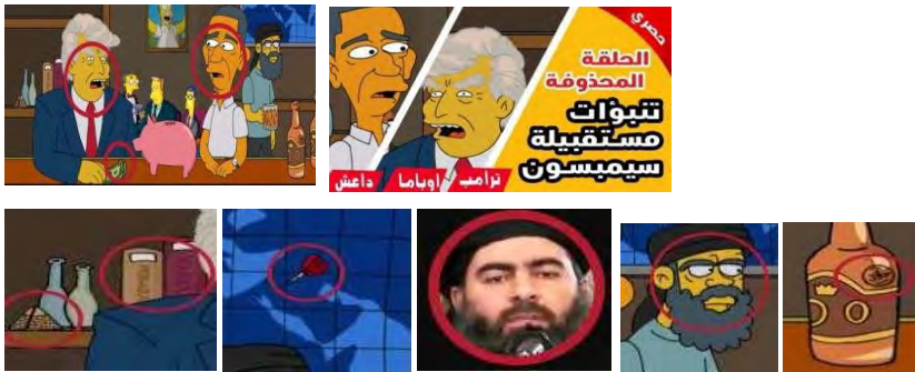
Figure 13 illustrates one of the scenes expressed a lot of hidden messages from a piggy bank - symbolizes that America may need in the future for China support- to the rest of the items in the background

In the special episode, which was displayed between 2004: 2008, "Trump" appears accompanied by a man from African assets called "Tommy". Tommy- which is similar to the Park Obama- speaks so afraid of something with Donald Trump. While Trump gives him two pieces of money category $ 100, who is irritatingly and tremblingly in a scene that does not exceed 10 seconds .