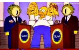
Figure No. (9) shows several cadre from the Simpsons series

The sixth axis :Expressing about American presidential elections in animation film as a political motivate