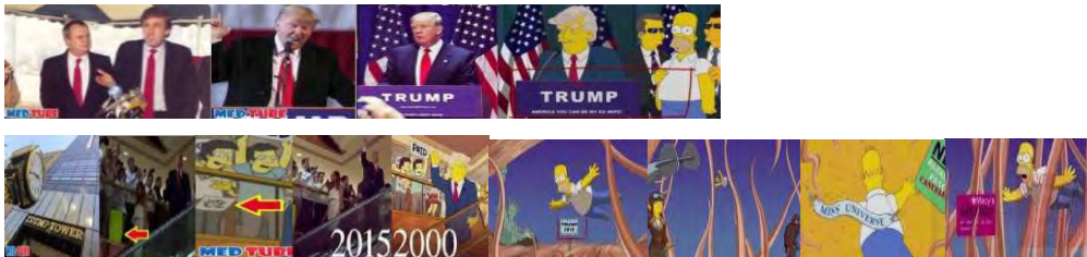
Figure No. (3) explains several cadres from one of the Simpson Family episodes in 2000 predicted that Trump becomes the president and conformed with the scene in the contemporary reality after several years when Trump was already nominated to preside the United States of America In the late 1980s, Trump was recently nominated in 2016 and the usual tray scene in the Trump Tower, and finally after he become the President of the United States and the fears about his shocking statements.

Where the father "Homer" goes to the future to find the conference "Donald Trump" and he is presenting to the USA president in the press. After The country will lose her mind . As America will fall down in the rest of the rich trump family , which control America and the the world too. There is a little who remembered this laughing and reliable episode that remembered by Sky News and broadcasted the comic episode that was given to the episode writer, a great fame since the date of Donald Trump won the presidency.