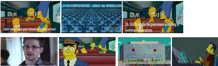
Figure No. (11) explains several cadres of the Simpsons series, at the top cadres illustrate the dialogue that the USA government monitors the telephone talks of her citizens, and below the cadres illustrate by the employee who was working on the USA National Security Agency and explains this fact

The scene of the Simpsons series in 2007 "Liza and Marg" was hiding afraid of the government tring to save their city from destroying. So liza is trying to warn her relatives about their conversations , because the government is spying on their conversation and it is not away that this spy is included all citizens.