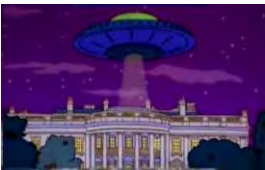
Figure No. (8) illustrates several cadre from the Simpsons series

The sixth axis :Expressing about American presidential elections in animation film as a political motivate