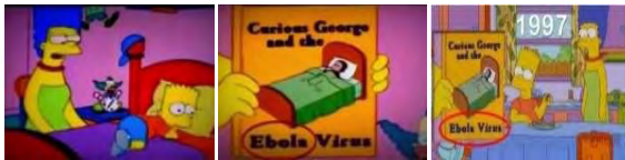
Figure No. (5) illustrates several cadres from the Simpsons series

The Simpsons series predict with Ebola virus. in the 1997 an episode displayed about Ebola virus without having a relationship with the story of the episode, where the mother is introduced a book for her patient's son carrying his cover the phrase" Virus Ebola "and shows a sleeper monkey. It knows that the monkeys pointed out the accusing fingers for a long time therefore being carried by the virus and the origin of its spread. When the series team workers were asked about this, their response was that the disease was known since 1976 and renewed its appearance in 2014. It was almost becoming a globally disease but it remained in West Africa.