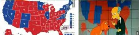
Figure No. (7) illustrates a cadre from one of the Simpsons episodes

And the absent reality of everyone that Trump has expressed its political ambition to reach the USA presidential chair in 1987, after one year the appearance of the first episodes of the series " The Simpsons", and announced his candidacy since October 1999, to enter the USA presidential race for the first time in 2000. Candidated by A small American reform party. Some political analysts surprised his shares by winning Trump the USA presidency, nominated by the Republic party. As he appeared in The Simpsons series since 17 years in the 84-year-old in 2033, and he has brought to America a Sufficient crisis and broken finances in external debt and in the dependency of Europe, China and their subsidies. Grape. This scenario comes in contrast to the trump election campaign in which he is promised a maximum economic residence and restoration of America.