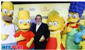
Figure No. (2) illustrates the image " Matt Groening With puppets of cartoon Simpson character,"

As for the Simpson family, ""The Simpsons" called in the arabic version ""omer Shamshons", "The character of "Simpson Jay Homer" and famed by" Homer" is a fake character and the hero of the animation series of the Simpson family, the series subject that Homer family-with the strange yellow to attract attention- consists of Homer, the father and his wife" Marge, and three kids: Bart & Lisa & Maggie. He was working in The nuclear power station "Serenfield" and Homer embodies the American moderate class. acting his voice:" Dan Castellaneta". For the first time on television, he appears with the rest of his family, in a short film entitled "Happy night" on April 19, 1987, the character of "Homer" is designed by Painsit, "Matt Groening" while he is waiting in James L. Brooks' office hall "After its appearance for three seasons on Tracey Ullman channel, then Fox channels network get the right of publication this series to that chain and presented its first episode on 17 December 1989. Fox company has owned the official sponsor of " The Simpsons" series until year 2022.