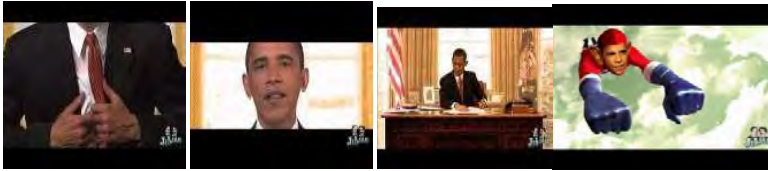
Figure No. (14) explains several cadres from Video clip entitled The Video clip lyric entitled "He's Barack Obama .. He's Come to Save the Day".

Barack Obama is the supernatural Hero as Super Man, which will achieve the impossible for America at the internal and external level in its international relations and the video clip shows the supernatural capabilities of Barack Obama.