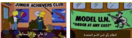
Figure No. (12) explains several cadres from the Simpsons series

Also in Hollywood movies, which merged the reality into the computer graphic and optical illusion as in the " Terminator part II", "Judgment Day", in 1991 so some videos came online and on YouTube thought that the series team workers may be Illuminati. As The series "Simpsons" on the 20th century Fox television mention some political phrases as a United Nations debate, "system with any pay "I am high with capitalism".