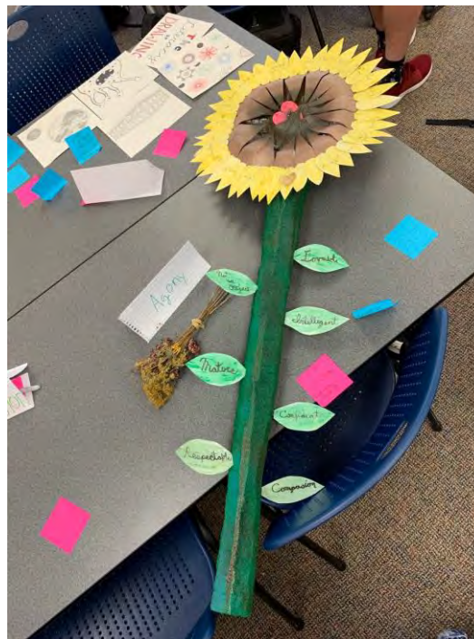
Figure 3. Mile's Literacy Narrative