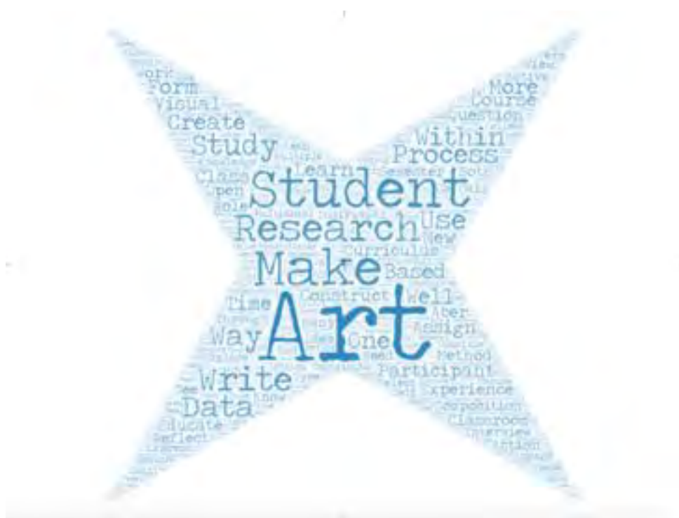
Figure 2. Research Prospectus Word Art