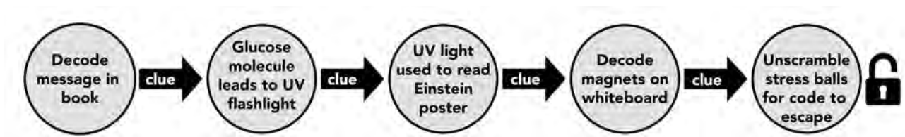
Figure 1. Linear path design of the Escape from School escape room.

The second room, Time Traveler , transported participants back in time to solve puzzles and riddles in order to return to the present time. This room was designed using an open path structure where, upon entering, participants could branch off into smaller groups to solve decade-themed puzzles. After groups solved each puzzle, they obtained a letter. Once all of the puzzles were solved, participants had the letters: L, A, T, V, R, and E, which they unscrambled to spell the word TRAVEL to answer the last clue and escape. Figure 2 depicts a graphic display of the Time Traveler escape room design.