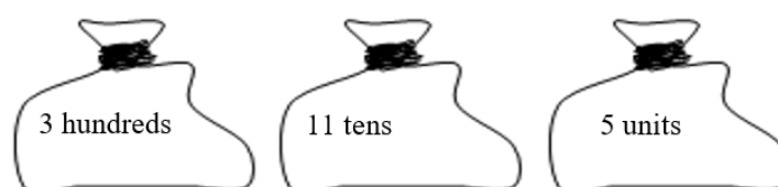
Figure 2. Item 10c from the translated test. (What number is in the bags?)