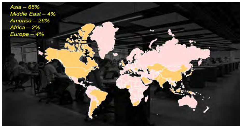
Figure 2. Map showing the regions (in yellow) from where the responses were received

agree to promote the post and to encourage teachers to act as the seed to distribute the internet survey to their network; (d) the groups/pages shall be from different parts of the world.