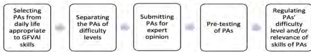
Figure 1. Development Process of the GFVAI Performance Activities.

the results of the functional vision assessment reflect how the student will function visually. Thus, while preparing the functional vision assessment tool, the process should include evaluating the individual's visual ability, defining what functional skills are, defining situations that require vision in each functional skill, and determining how the individual performs visual functions in situations that require vision to complete a particular skill.