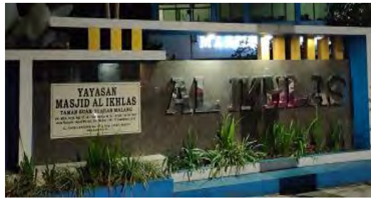
Figure 2. Al Ikhlas mosque sign

Some worship places attach the name of the institution or foundation. This gives information that the place of worship is owned by a particular institution or foundation.