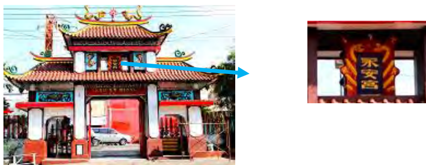
Figure 9. Han script in a Chinese temple

Chinese is a symbol that gives economic benefits (Xu & Wei, 2018). Besides, the Chinese also contribute to marking Chinese culture. Chinese characters displayed in public spaces show the continuity of the symbolism of traditional Chinese culture (Lou, 2007). The appearance of the Han script both in the pagoda is another form that marks the symbol of existence, namely ethnicity, and religion. The texts containing the Han script show how the ethnic Chinese maintain their ancestors and culture in the overseas area. As mentioned above, the Chinese tribes who migrated to Indonesia were more interested in taking care of the economy than in other fields. With economic power, they can show off the existence of their tribes and ethnicities and then continue to introduce their culture.