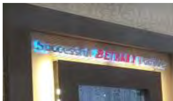
Figure 8. English, church, and diaspora

English appears to carry international missions (Bruyèl-Olmedo & Juan-Garau, 2009). Every time English is used, it indicates that internationalization is happening within the institution. The spread of English in public life becomes a medium for expressing a passion for Western culture, especially the upper classes (A. H. Al-Athwary, 2017). However, there are other things to consider. The emergence of English can be used to show the symbol of the diaspora through religion.