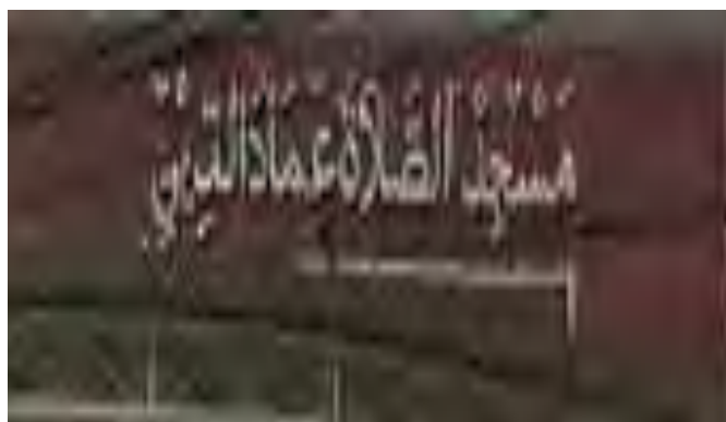
Figure 12. Mosque with Arabic script

From table 11, Arabic (script and/or lexicon) is involved in 79 data (87.8%). This situation indicates that Arabic has become an important language in conveying religious messages. Islamic symbols, such as monotheism, holy verses of the Koran, Islamic figures, and Islamic expressions, are played in educating and instilling the love of worshipers towards their religion. Although Arabic is studied and used in a limited domain (madrastas, Islamic boarding schools, Islamic universities), this does not rule out the use of Arabic and its script in massive communication in society. With the majority of Muslims, the use of Arabic is not only considered to understand its meaning, but rather the strengthening of Islamic symbols.