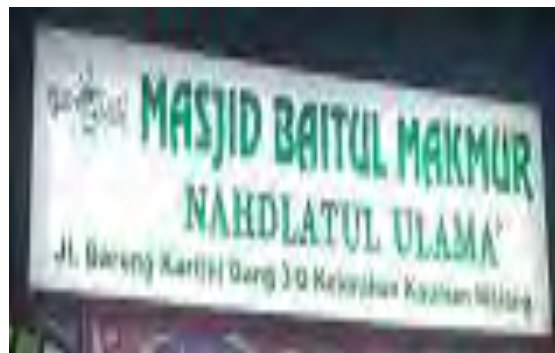
Figure 3. The name of a mosque with the Islamic organization

Christianity in Indonesia has sects, namely Lutheran (Lutherans), Kharismatik (Charismatics), Injili (Evangelicals), and Bala Keselamatan (Salvation). The religion of Islam in Indonesia, especially in Java, also developed Islamic organizations, namely Nahdlatul Ulama and Muhammadiyah. Islamic organizations certainly influence people's perceptions. The information displayed in the sign will support the perception of the community to decide whether to become worshipers or not.