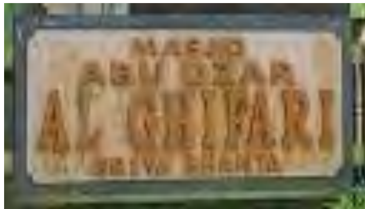
Figure 5. promotion through religion

Places of worship can also be a promotional medium. Promotion through religion is a more effective promotion model. The promotion has the aim of disseminating information about a product to potential customers, getting new customers, increasing sales and profits, differentiating and favoring products compared to competitors, shaping product images, and changing consumer behavior and opinions about the product.