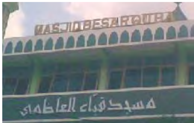
Figure 1. The mosque name which replicates the Quba Mosque name in Medina

From the survey, researchers found six types of information. This information appears in signs on the signboard of places of worship, namely (1) identity (2) owner (3) Islamic sector organization, (4) warning, (5) promotion, (6) location marker/address. The names of places of worship were taken from the surah in the Koran, Muslim leaders, heroes, and Islamic quotes. There is a mosque name that resembles the name of a mosque in the City of Medina, Saudi Arabia.