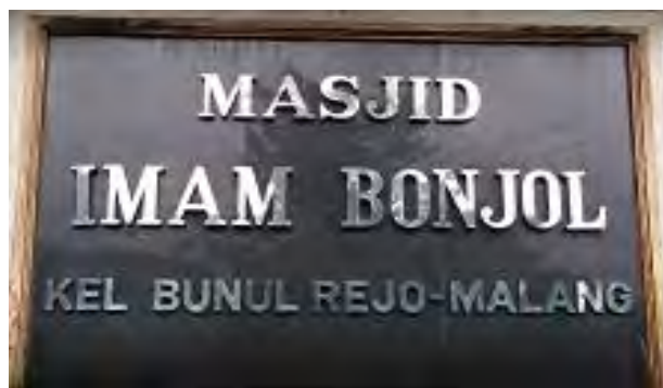
Figure 6. Street name use as mosque name

Figure 6 is an example of the location marker where Imam Bonjol Mosque is located on Jalan Imam Bonjol Malang. With the vast area of Jalan Imam Bonjol, Imam Bonjol Mosque can be a location marker. For example, when someone asks about a place in the Imam Bonjol Street area, information can be given by referring to the area near the Imam Bonjol Mosque (if the area is close to the mosque).