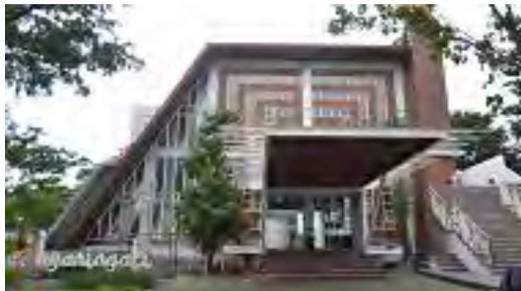
Figure 10. Javanese in mosque name

The locality is not always an ancient and traditional symbol. Javanese is the local language used by the majority of the people of Malang with the East Javanese dialect. The Javanese language is also a traditional language where this language is passed down from generation to generation and is still used today. However, the use of Javanese in naming places of worship, especially mosques, is actually able to present a symbol of modernity.