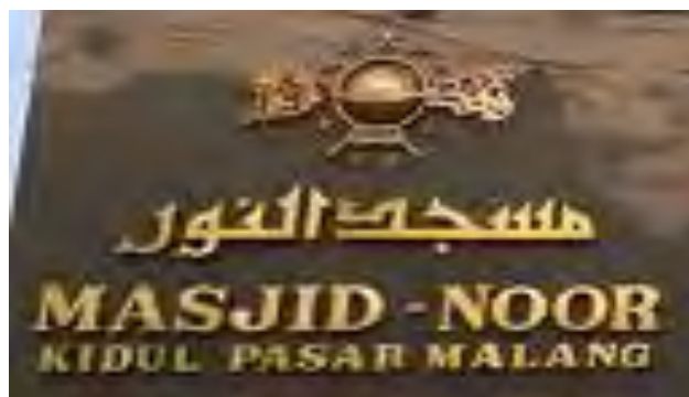
Figure 11. Multilingual Arabic, Bahasa Indonesia, and Javanese

Javanese is no longer considered an ancient language. Javanese is able to enter into the joints of modernity which substitutes the role of Arabic. Cahyaningati (light in the hearth) is the name of a mosque with modern architecture (see picture). Cahyaningati is a substitution phrase from An-Nur (light) where the second name is more popularly used in mosques in general. This substitution step with modern architecture is a symbol where locality is able to 'call' modernity. Local people who are predominantly ethnic Javanese are becoming increasingly aware that Javanese can take part in the arena of modernity.