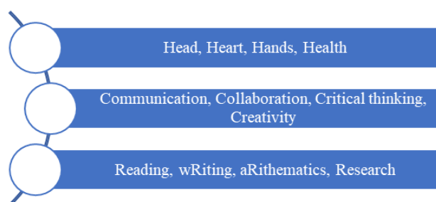
Figure 1. 4Hs4Cs4Rs for 21 st century learning and teaching

The percentage of Thai educators toward 21 st century learning and teaching seem to be concurrently explored. They know and understand that classroom activities is now call for adapting. Learning behaviors are now changing and tend to be technology-enhanced learning. Technology open their windows opportunities to access of what data and information as they wanted [24], [25]. They are ready to participate with borderless learning, key elements to change learning behaviors and preferences in this century. Learners concern 4Cs, 4Rs, and 4Hs to live and learn, it can be explained 4Cs consisted of communication, collaboration, critical thinking, and creativity; 4Rs consisted of reading, writing, arithmetic, and research; 4Hs consisted of head, heart, hands, and health as displayed in Figure 1. They agree that 4Cs and 4Rs, learners should have and should learn more than 64%. However, other skills should be done, but it is varied and differenced.