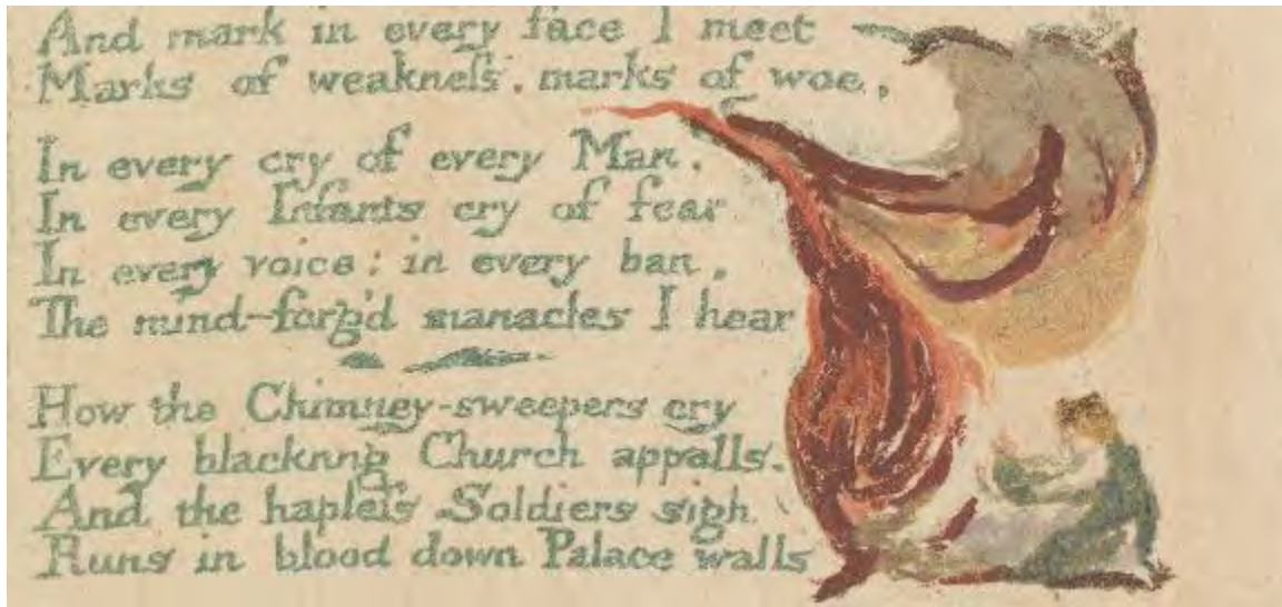
Figure 5. The fire in the margin of “London” ( Songs of Innocence and of Experience , Copy F).

The final step of this assignment is for students to gather together the preparatory steps after having revised each one separately. They then compose a paragraph that reflects on the relationship between text and image in general, based on what they have said about composite art, both from William Blake and their everyday messages. These conclusions become the basis for a class discussion near the end of the semester, and several interesting points emerge from these conversations.