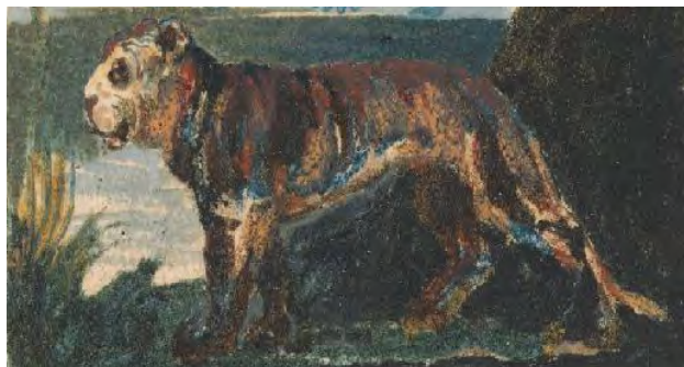
Figure 2. “The Tyger” ( Songs of Innocence and of Experience , Copy F). The illustration of the titular creature looks friendly, challenging the perspective of the poem’s speaker.

Elsewhere in Blake’s oeuvre , images function more straightforwardly. For instance, the scene that decorates the bottom of “The Chimney Sweeper” from Songs of Innocence ( Figure 3 ) appears to be an illustration of a sweeper’s dream recounted on lines 10-20, in which children are freed from “coffins of black” by an angel and rejoice on a “green plain” near a river (ll. 12, 15). Yet even this image may be read ironically: the figures of this scene appear to be dancing joyously, but they can also be interpreted as fighting. The blend of serene and sinister tones nicely complements the ironic text of the poem, in which an innocent (naïve) speaker celebrates the consolation provided to the working poor by promises of an afterlife. Though the exploited children of the poem are thereby comforted and encouraged to “do their duty,” both the poem and its companion piece in Songs of Experience clarify the extent to which such religious beliefs serve as tools for the ruling classes to keep the poor content with their miserable lives on earth. As I have discussed in an article in The CEA Critic , attention to Blake’s images enriches classroom discussions: asking students first to write down a description of the illustration of The