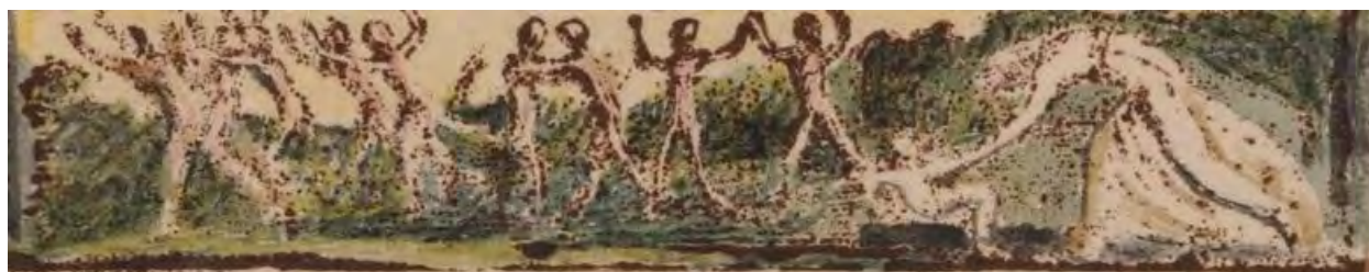
Figure 3. The image at the bottom of “The Chimney Sweeper” ( Songs of Innocence and of Experience , Copy L).

Chimney Sweeper and then to share it aloud often results in students voicing competing interpretations. 11 Highlighting this divergence of readings, I ask students to consider whether the possibility of a sinister reading of the image could undercut the apparently hopeful ending of the poem (which many students initially take at face value). Leading questions about the position of the image – which one of my students characterized as “squished down on the bottom” – can help them see how even the layout of Blake’s plates can carry meaning, here suggesting a parallel between the “confinement of the image” and the “social position of the chimney sweeps” (Leporati 95).