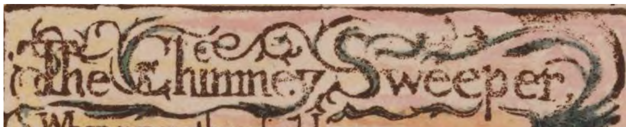
Figure 1. The title of William Blake's "The Chimney Sweeper" ( Songs of Innocence and of Experience, Copy L ). 4 Chimney sweeps appear in the letter C and above the letter P.

image working complexly in tandem to produce meaning. 3 Text and image cannot be fully separated in Blake's works, as they comment upon and modify each other's significance.