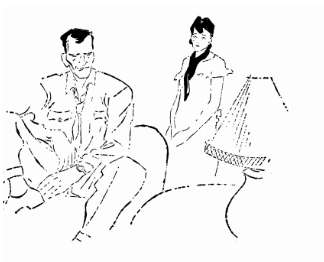
Figure 2: Patrick's Confession.

grocery store; and Mary's giggle in the living room, with the outlines of the detectives in the background. The first and third illustrations are especially striking in their contrast.