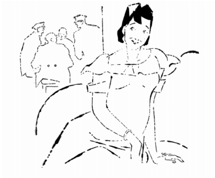
Figure 3: Mary's Giggle.