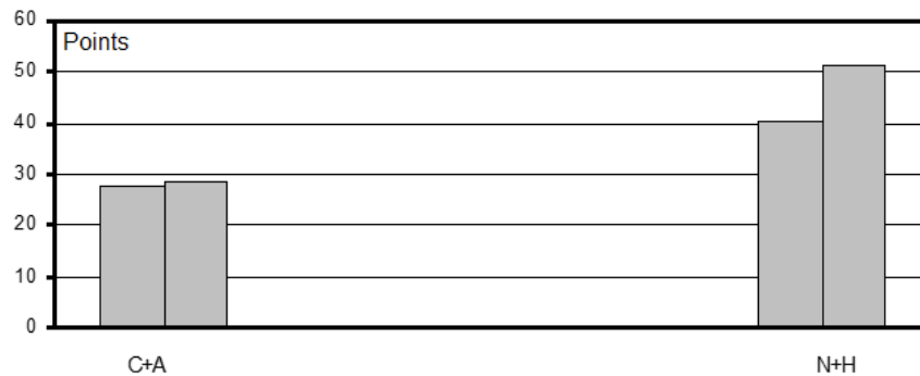
Figure 2. Increasing creativity growth using Popek's (2000) questionnaire among the first-year students at the beginning and the end of the academic year

The application of this method to assess the level of creativity of students allows for dynamic analysis of two areas (cognitive and characterological) of future engineers of technical specialties (technical aspect) in foreign language classes (humanitarian aspect).