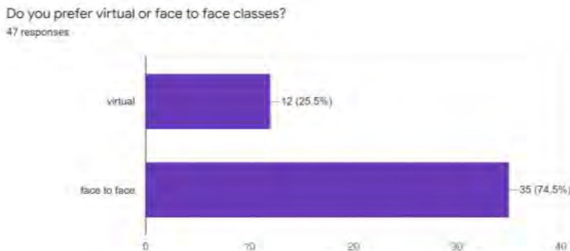
Fig. 1. Comparison of virtual to face to face classes

This paper shows students' perceptions about online learning verse face to face learning. Figure 1 explains the percentage of students that prefer virtual to face-to-face classes.