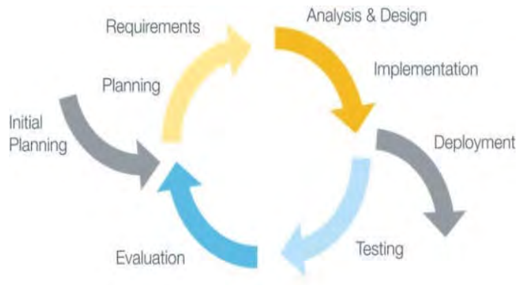
Figure1. The responsive design process, (Heppard, 2012)

The classical application design process is linear. When a step ends, the next step begins. The progression of the steps is only in one direction but when problems occur, solutions are not performed gracefully. One of the problems of the classical application design is creating only for the standard desktop browsers. Once the responsive design implemented, the application can be used properly on desktop computers, mobile devices, and tablets (Heppard 2012). The responsive design process is shown in Figure 1.