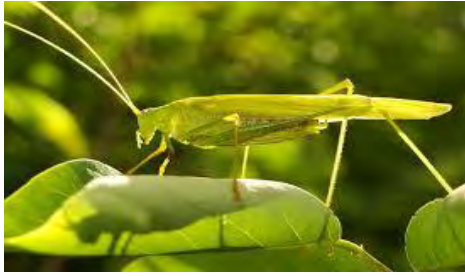
Image 1 grasshopper