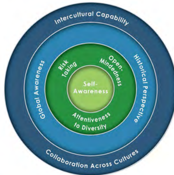
Figure 2. Cultural competence model.

how individuals progress from inward thinking to a capacity for intercultural collaboration (see Figure 2 below). Self-awareness of acknowledging implicit bias and preconceived notions about others is the initial stage. As individuals actively move out of homogeneous spaces and engage with other cultures, they develop through the stages of risk taking, and global awareness. Collaboration across cultures is the goal. Competence is valuable in all heterogeneous interactions in providing context and knowledge about how others process information.