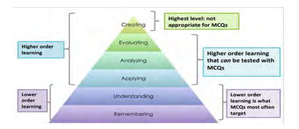
Figure 1 Levels of learning and Bloom's Taxonomy (from Jovanovska, 2018)

While analyzing an English textbook, Qasrawi and BeniAbdelrahman (2020) highlight the role of Higher Order Thinking Skills (HOTS) and Low Order Thinking Skills (LOTS) in developing language skills. However, these skills have to be assessed through Higher Level Questions (HLQs) and Lower Level Questions (LLQs). Once created, the standardized questions can be used in question banks of a Learning Management System (LMS). While discussing the steps for designing questions for a question bank for a system such as Blackboard, Hamad and Alnuzaili (2020) remarked, "We can specify the number of questions, type of question and level of difficulty, and the system will choose the questions randomly from the folders in the pool with the desired criteria. Besides, that there is a great advantage that each student will have different questions, and if they have multiple attempts, they will have different questions each time."