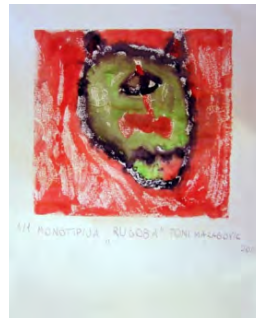
Figure 9 Monotype, self-portrait Monster of male student T. M., 5 th grade