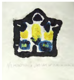
Figure 12 Monotype, self-portrait This is Me of female student M. D., 5 th grade