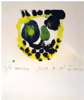
Figure 8 Monotype, self-portrait Black Eye of male student J. C., 5 th grade