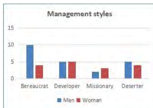
Figure 2. Management styles

One of the functions of the leaders is to carry out the management process in the organization. Leaders who are willing to follow the appropriate strategy will accelerate strategic activities [29]. The assessment results of the Management Style Diagnostic Test show the management style shown in Figure 2.