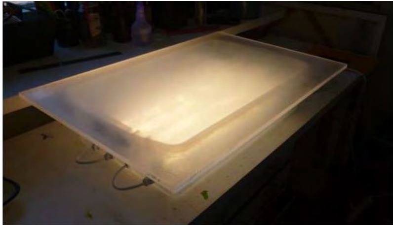
Figure 4 Lightbox