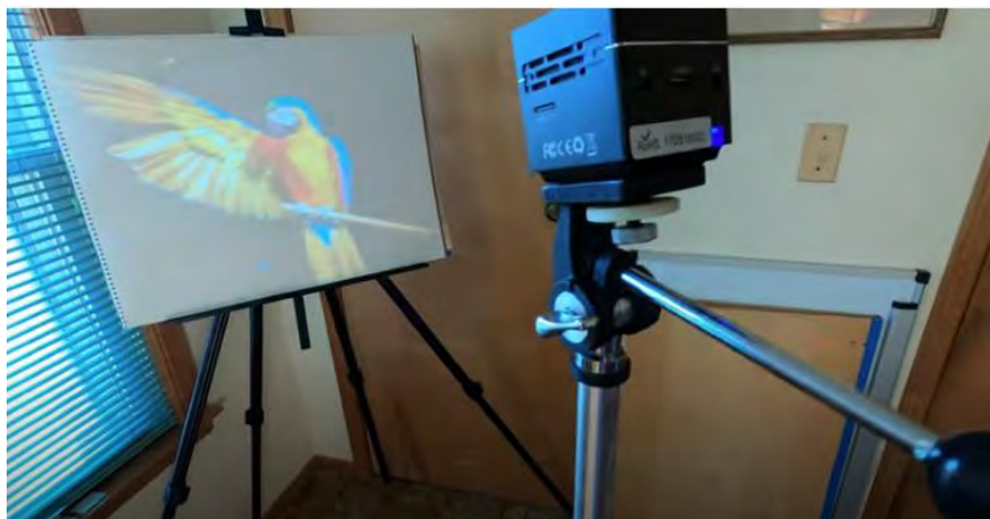
Figure 8 Projection