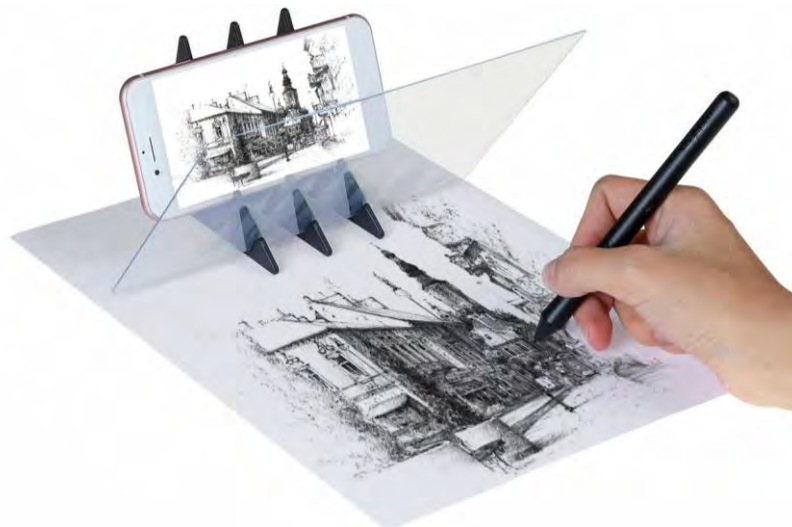
Figure 3 A simple mirroring device that can be used with mobile phone and table