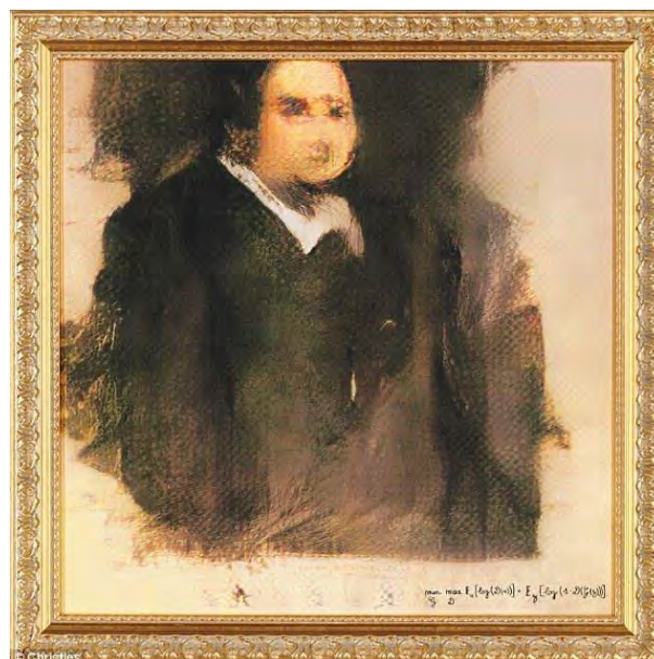
Figure 14 The first painting to be sold with the signature of artificial intelligence is "Edmond Belamy's Portrait"

As Temel (2009) has shown, artificial neural networks can also be used to detect art forgery. On the contrary, it may try to replace the artist: as a matter of fact, a painting produced using artificial intelligence and algorithm was first put on sale in 2018. The "Portrait of Edmond Belamy", developed by the Paris-based art collective "Obvious", is the work of a computer algorithm that includes about 15000 portraits produced between the 14th and 20th centuries. It is one of a group portraits of the fictional Belamy family (Figure 14).