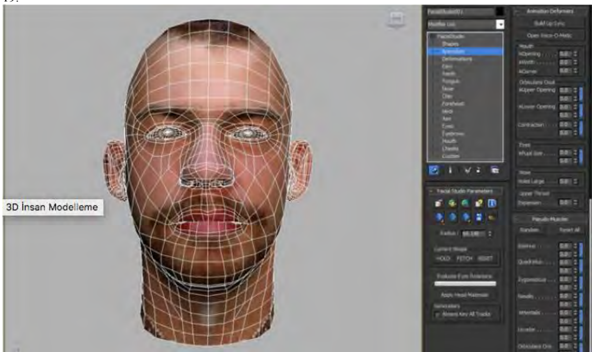
Figure 11 Three-dimensional modeling