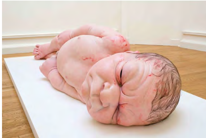
Figure 13 Ron Mueck A girl 2006. Polyester resin, fiberglass, silicone, synthetic hair, synthetic polymer paint

Artists who tend to these styles today may have other philosophical concerns as well, this is somewhat related to the perception that surprise and shock developed with post-modernism is an aesthetic aspect. The truth is that we are now evolving towards an aesthetic level that will not admire a work, without a solid infrastructure and intellectual ground behind it just because it has acquired a surreal resemblance to the object.