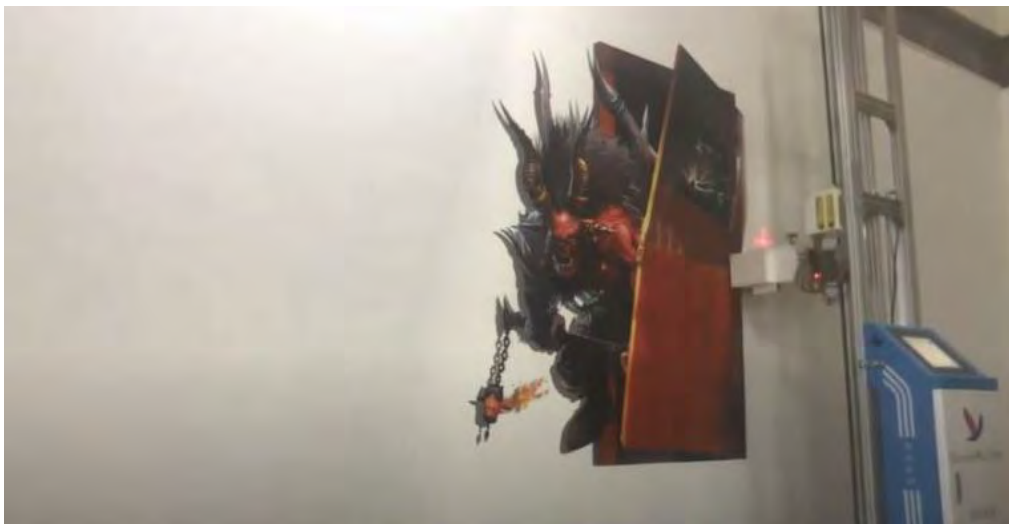
Figure 10 Painting machine capable of automatic three-dimensional printing on the wall