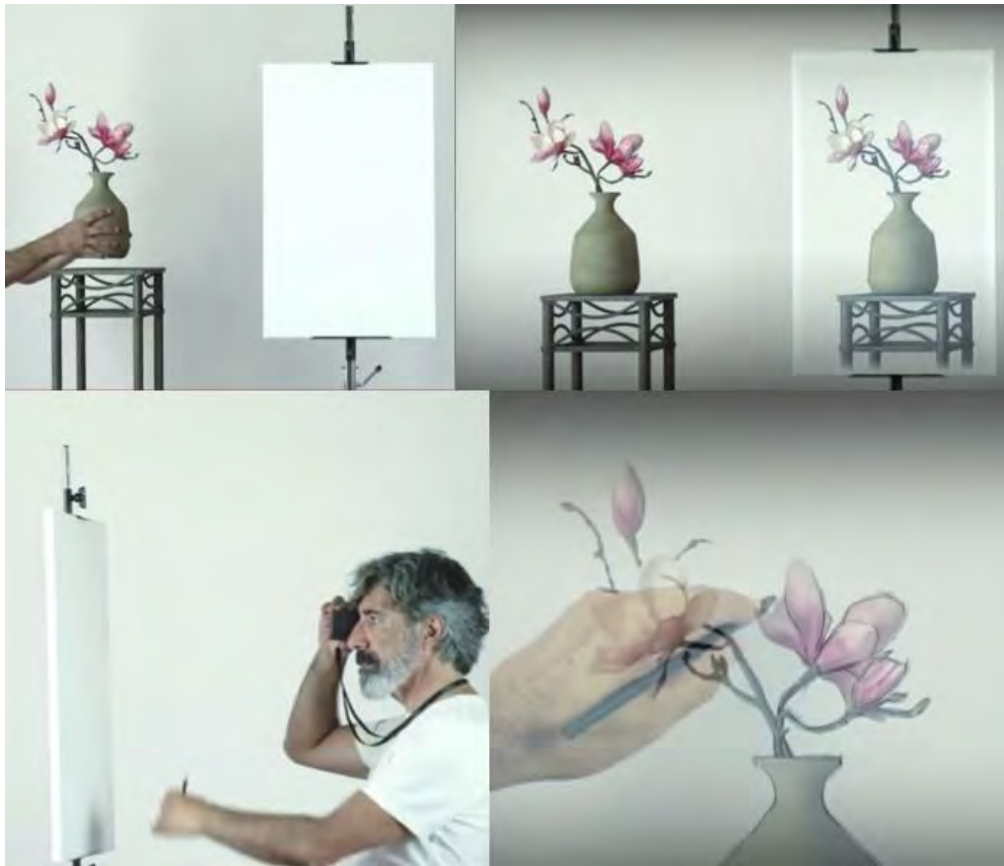
Figure 7 Drawscope