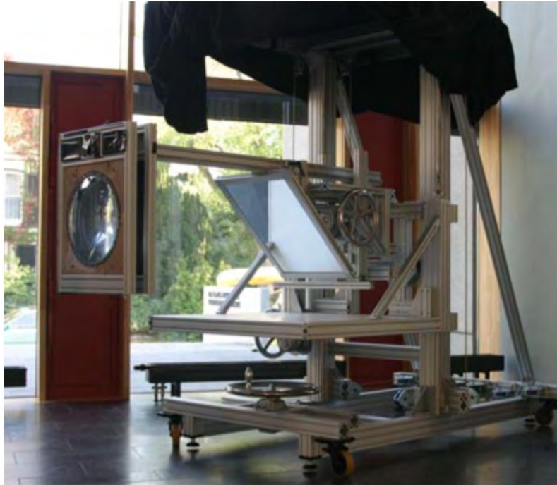
Figure 1 The Experimental Historical Camera Obscura Max Planck Institute Berlin

stabilize the camera's image; In 1839, Louis-Jacques-Mandé Daguerre improved the exposure and stabilization processes within the camera obscura with chemical processes (Davenport, 2000: p.6-8). All recording and printing processes owe the invention of photography. Thanks to reproduction, Benjamin (2005, p.13,15,21) says of loss of the authenticity and the aura; he claims that it has been freed from the ritualist structure of art. If we expand the meaning of magic and ritual here, actually the art has lost its inspiration. Girgin (2018, p.35) approaches the subject more functionally: "After the first world war, the paintings created with different meanings in the Pop Art and New Realistic approach tried to integrate the popular culture on the one hand and the elite on the other".