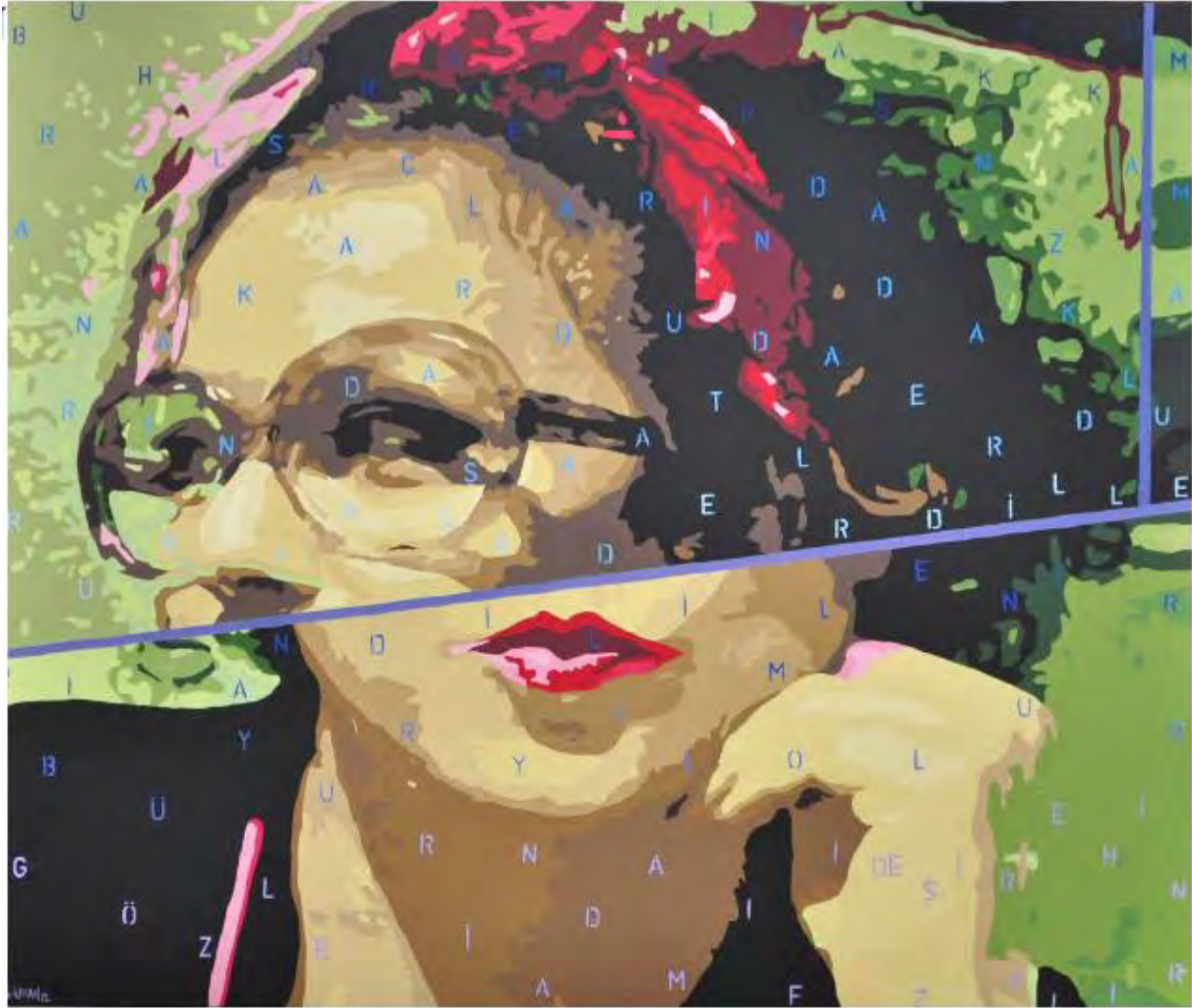
Figure 12 Deniz GÖKDUMAN, Bu Hürrem Başka, 2012, Acrylic on MDF, 154x182,5 , Bora Collectio