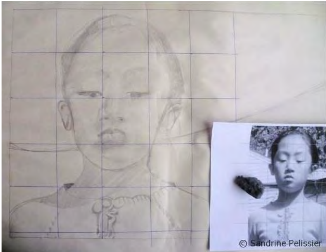
Figure 2 Copying by square